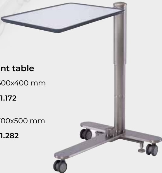
Mobile Instrument table Plate size 600x400 mm ART. NO. Z1.172 Plate size 700x500 mm ART. NO. Z1.282