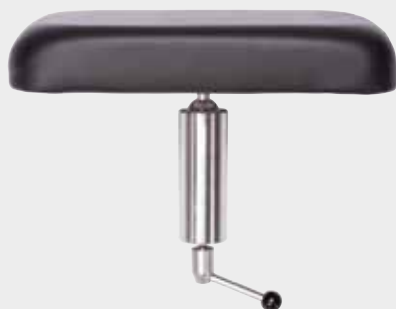
Head plate, small