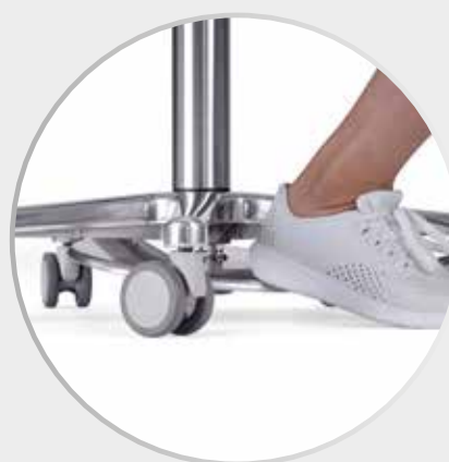
Height adjustment with foot release