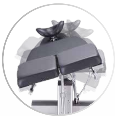
Airplane function with 17° Rotation angle