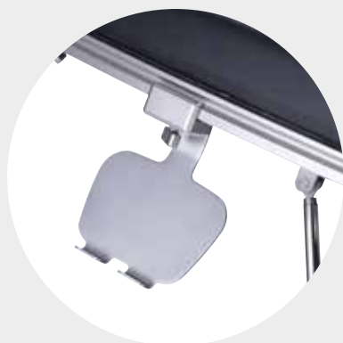
Remote control holder, short ART. NO. Z1.307