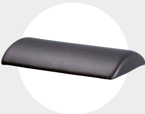
Lordosis support cushion ART. NO. Z1.140