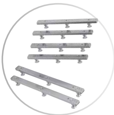
Mounting rail set VENUS (6 pcs.) for additional accessories