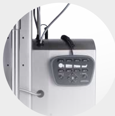
Magnetic plate for remote control ART. NO. Z1.045