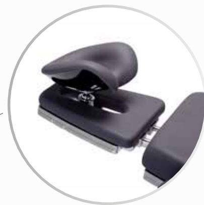
Head shell for e.g. rhinoplasty

Scan the QR code and experience PRIMUS live in the product video