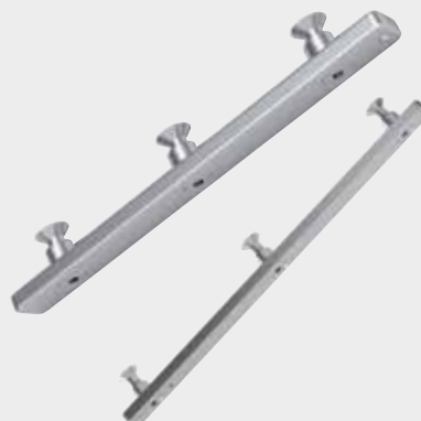
Mounting rail – GENIUS/VENUS