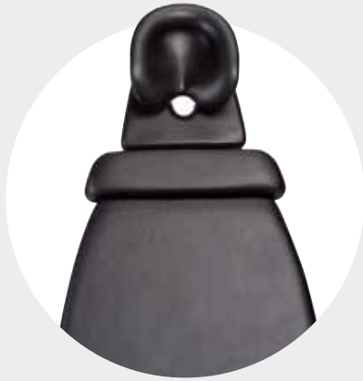
Back section - extension, narrow

For patient positioning like on cloud nine