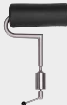
Hair transplant support "neck support"