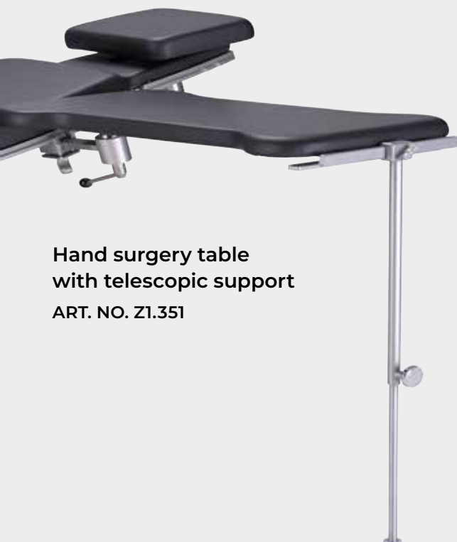
Hand surgery table with telescopic support ART. NO. Z1.351