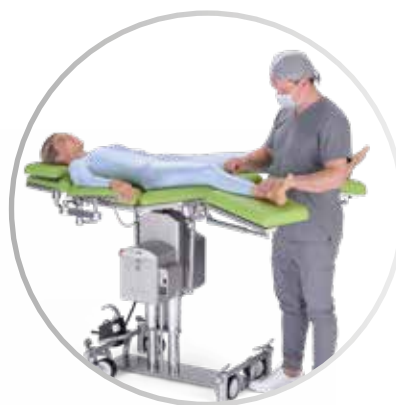
Ergonomic work between the legs, e.g. liposuction, intimate surgery