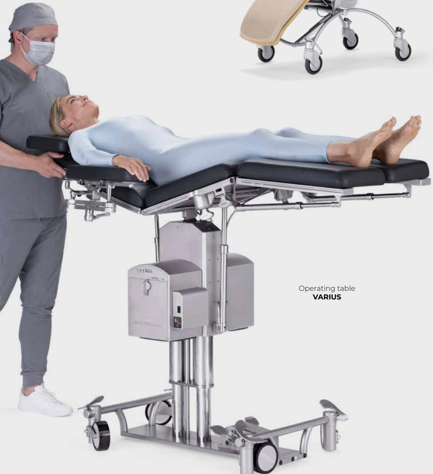
Operating table VARIUS