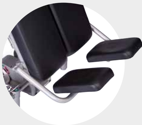
Standing plate - VARIUS/VENUS (1 pair)