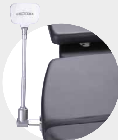
Remote control holder FLEX, hinged ART. NO. Z1.313