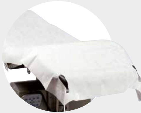
EasyCover (150 pieces) disposable table cover