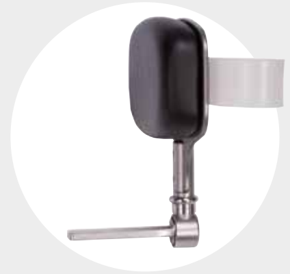
Arm support lateral, with fastening belt