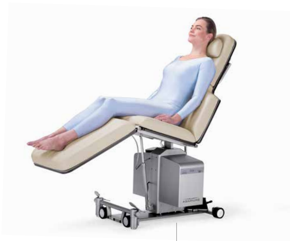
Ergonomic positioning for surgery and treatment