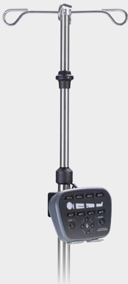
Remote control holder on infusion stand ART. NO. Z1.243