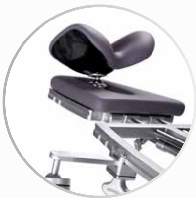
High-quality stainless steel construction