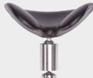
Horseshoe-shaped headrest, small