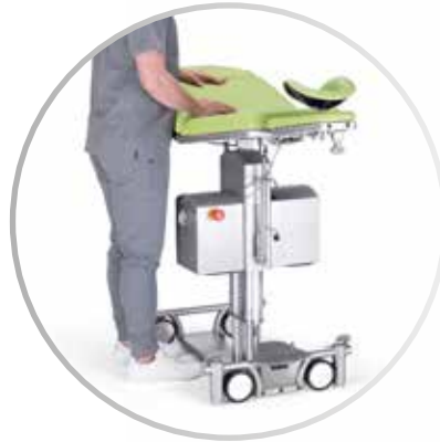
Slim design and legroom