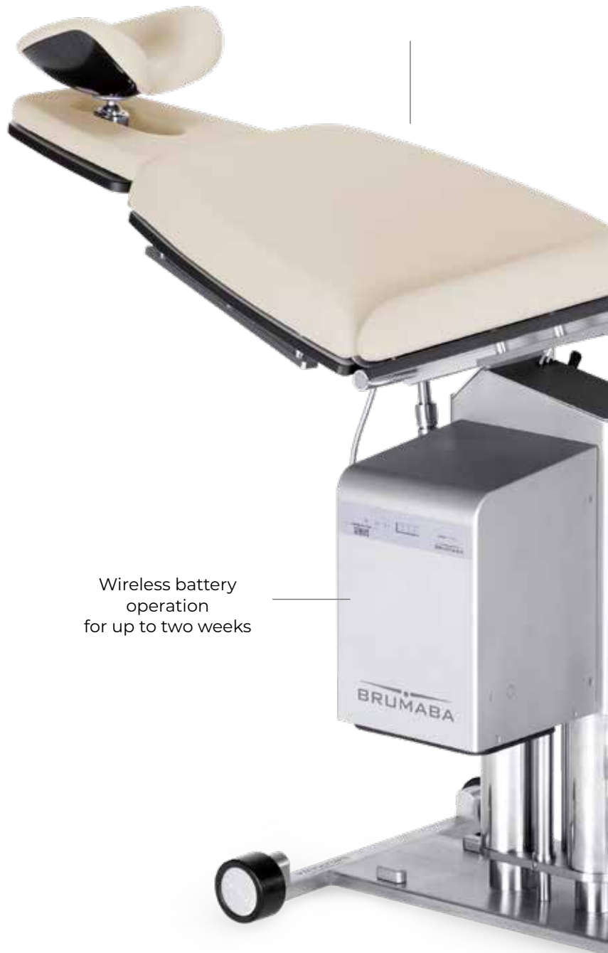
Wireless battery operation for up to two weeks