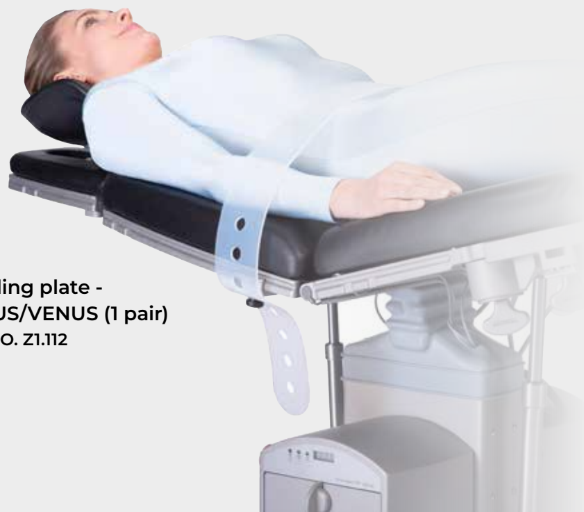
Standing plate - VARIUS/VENUS (1 pair) ART. NO. Z1.112