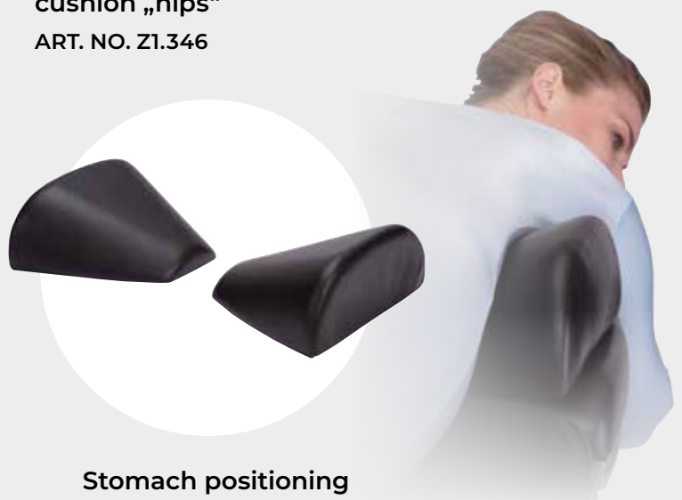
Stomach positioning cushion, trapezoidal (1 piece) ART.NO. Z1.098