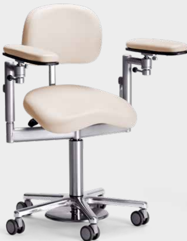
Operating chair BALANCE ADVANCE