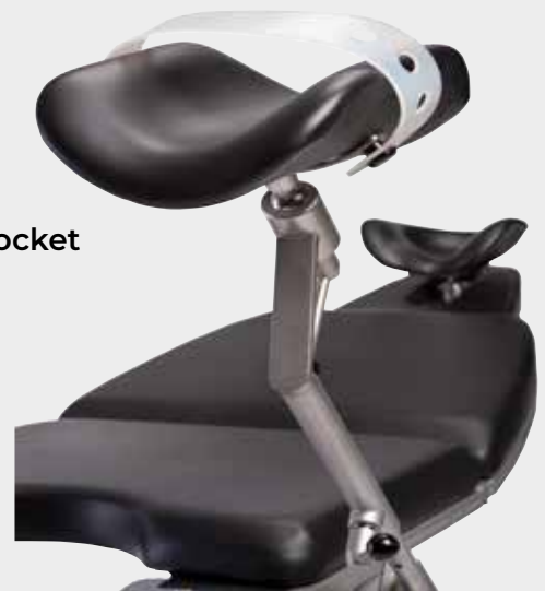
Leg holder - OP, with 2 ball-and-socket joints (1 pair) ART. NO. Z1.343