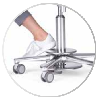
Optional with brake