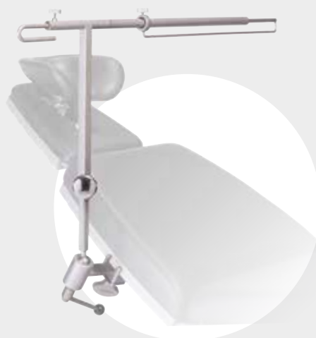
Anesthetic frame, universal ART. NO. Z1.015