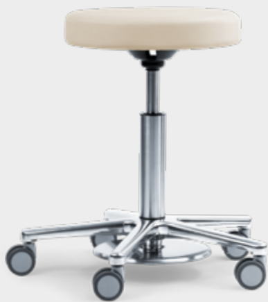
Stool model COMFORT