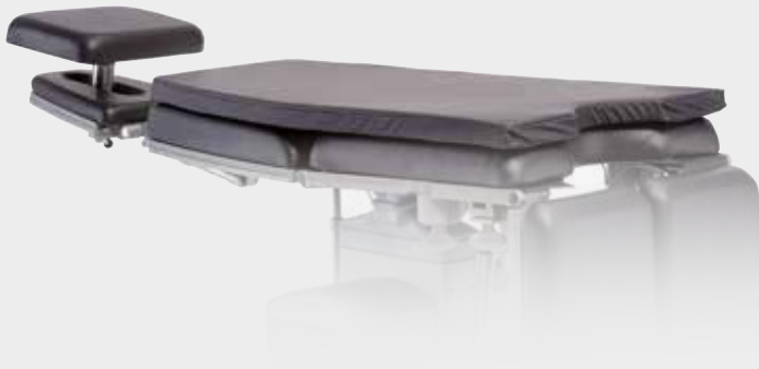
Mattress viscoelastic, short with gynecological cutout ART. NO. Z1.213