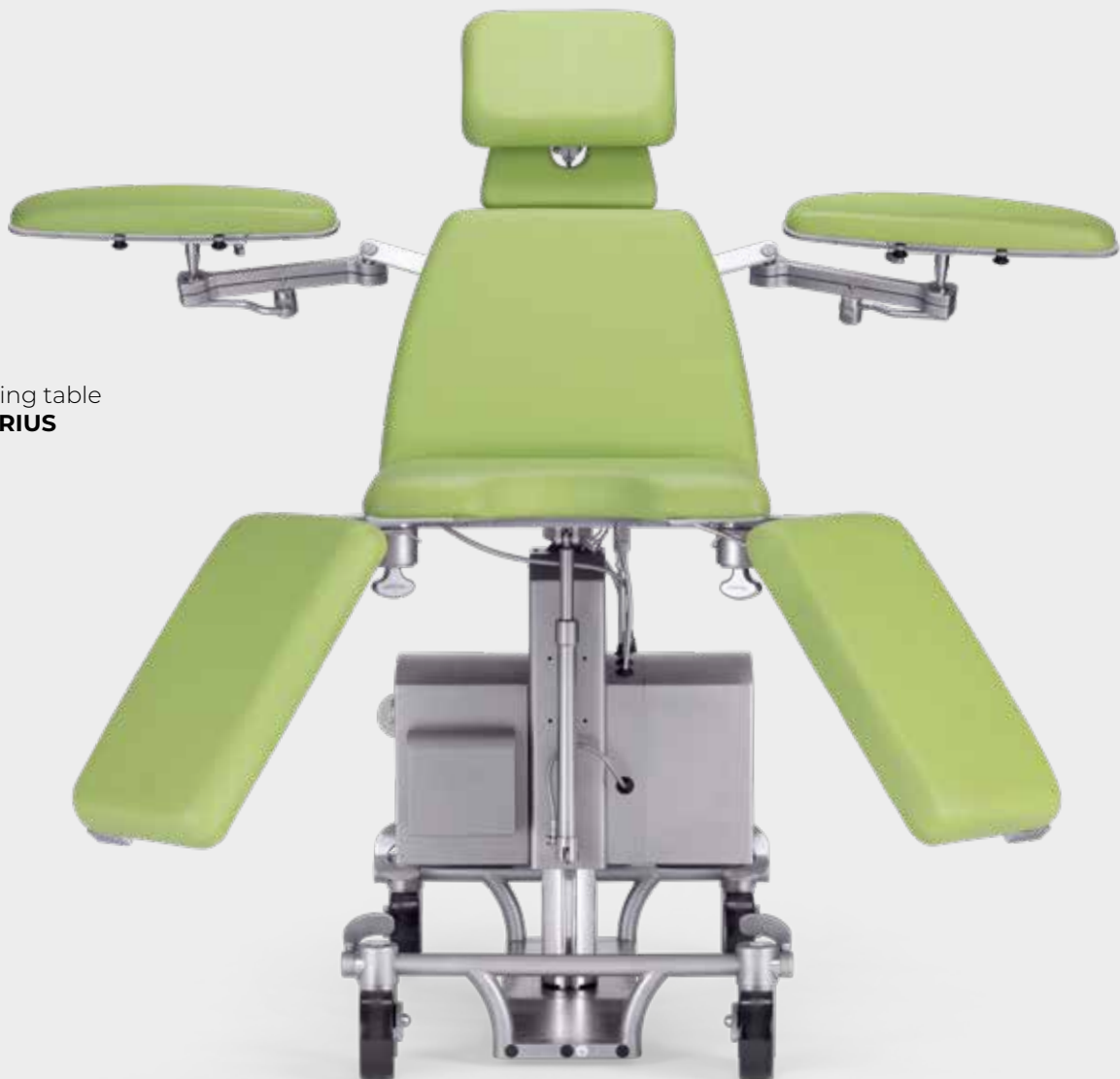
Operating table VARIUS