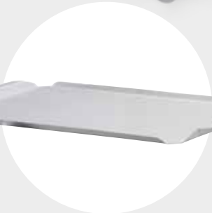
Aluminum shelf for Instrument table ART. NO. Z1.245