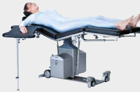
Hand surgery in natural situation