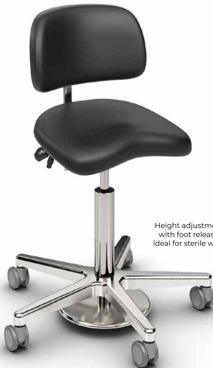
Height adjustment with foot release, ideal for sterile work