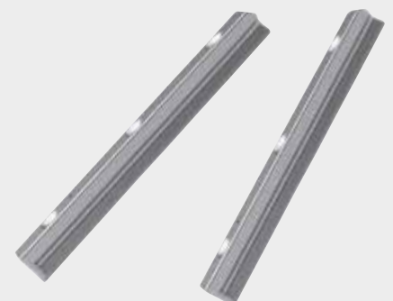
Mounting rail 250mm, solid – GENIUS/VENUS Required for use of the leg holder or the hand surgery table with GENIUS and VENUS ART.NO. X.000087