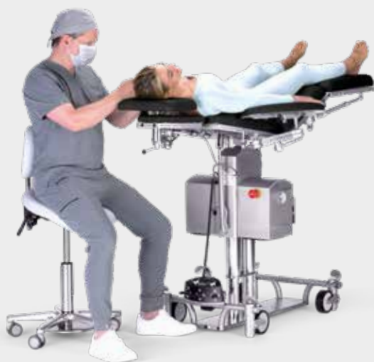
Ideal position for facelift

BRUMABA enables you to work ergonomically and perform precise operations. Experience maximum safety and efficiency for your everyday procedures with our solutions.