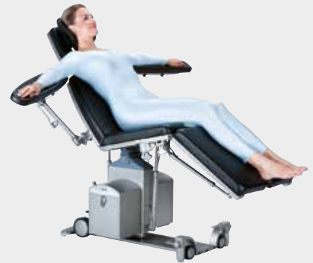
Beach chair position for breast surgery