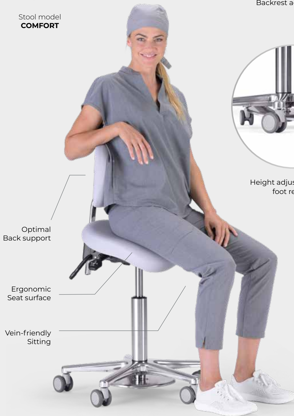
Optimal Back support