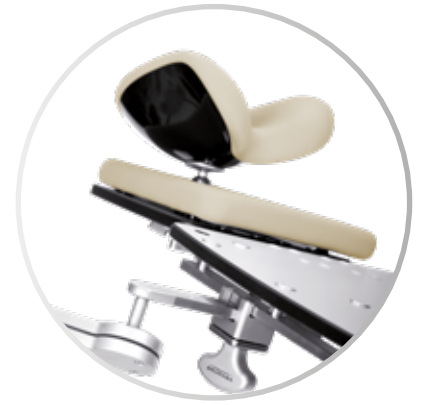
Panel and rail construction

ART. NO. G4.01.23 GENIUS DTA ART. NO. G4.11.23 GENIUS DTN ART. NO. G4.01.12 GENIUS STA ART. NO. G4.11.12 GENIUS STN