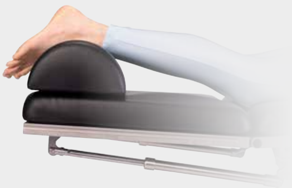
Half roll cushion ART. NO. Z1.100 (small) ART. NO. Z1.101 (large)