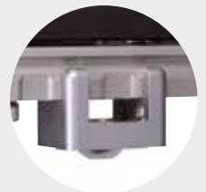
Mounting glider with clamp