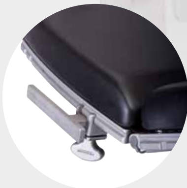
Mounting adapter, 25x10 mm

For attaching accessories from other manufacturers