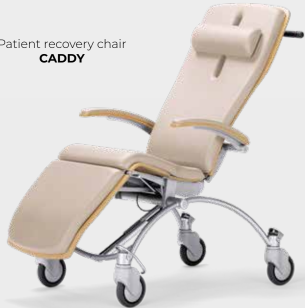
Patient recovery chair CADDY