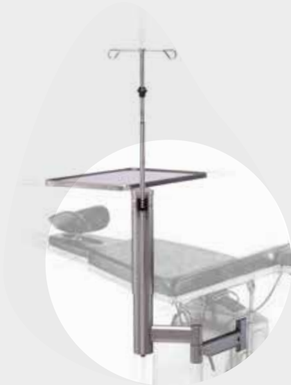
Infusion stand on the column ART. NO. Z1.280