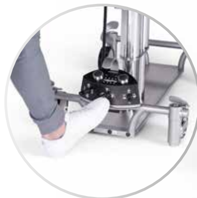
Foot switch for convenient adjustment