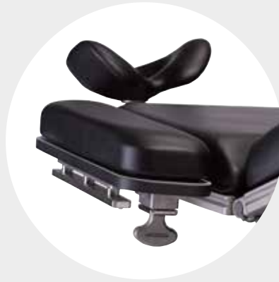
Foot section extension / side extension, narrow - OP