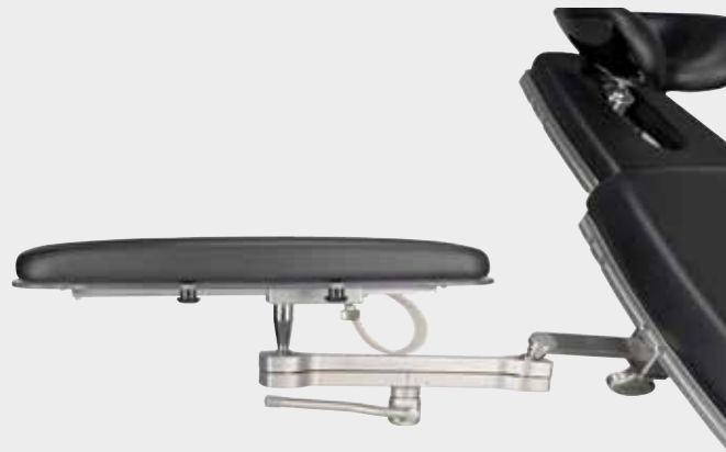
Armrest OP PRO with fixing strap and length adjustment ART. NO. Z1.331