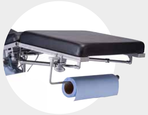
Paper roll holder