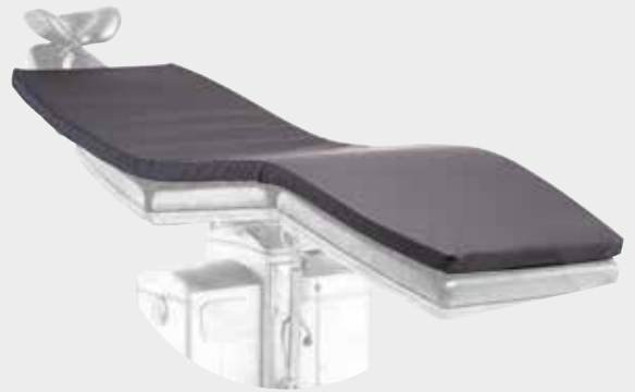
Mattress viscoelastic ART. NO. Z1.171