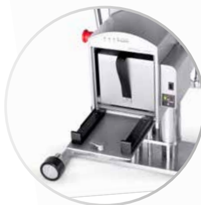
Wireless battery operation for up to two weeks