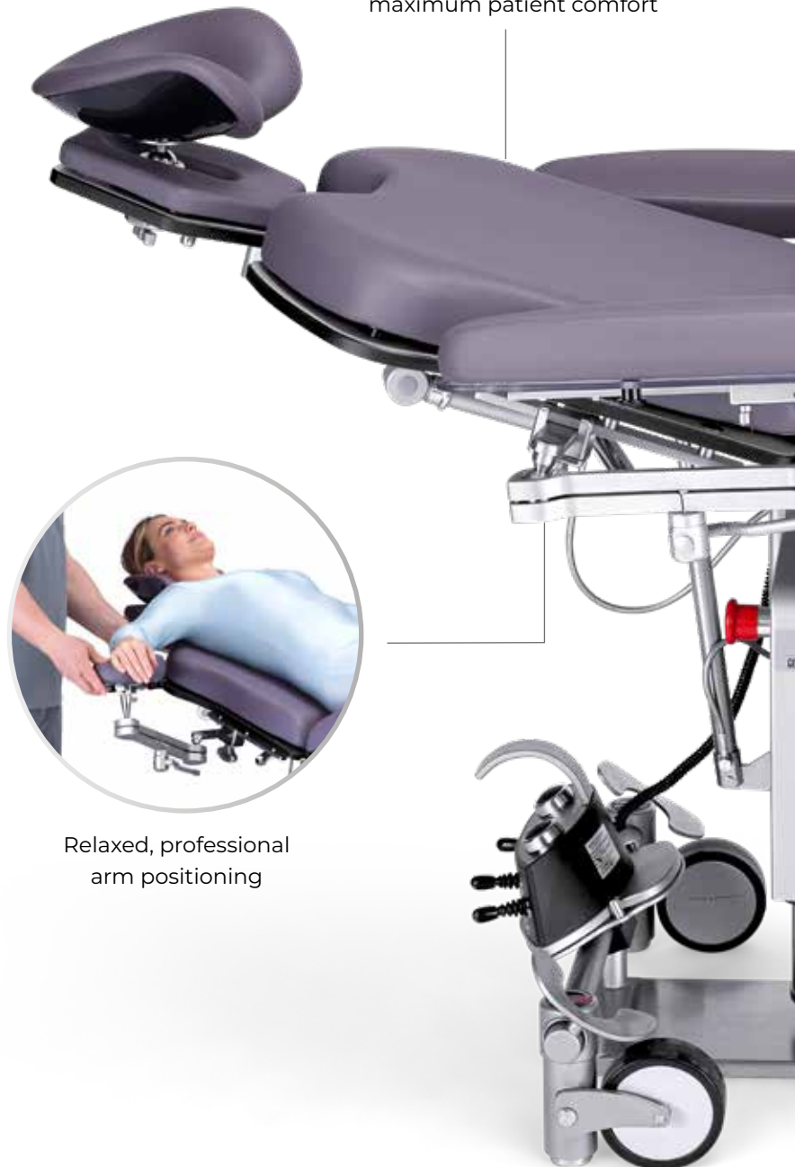
Relaxed, professional arm positioning