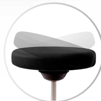
Available with COMFORT SWING seat cushion