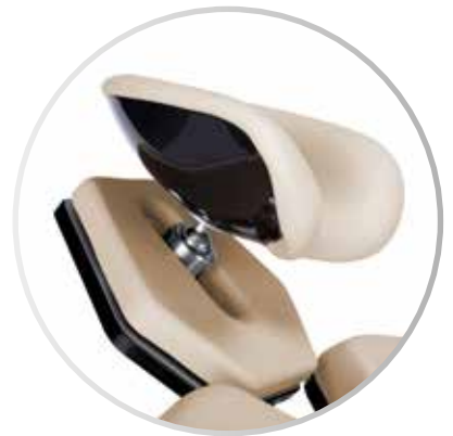
Three-dimensionally adjustable headrest