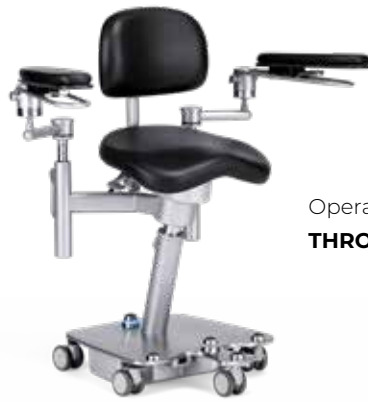
Operating chair THRONUS T3