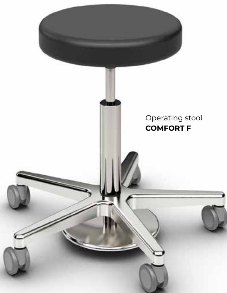
Operating stool COMFORT F