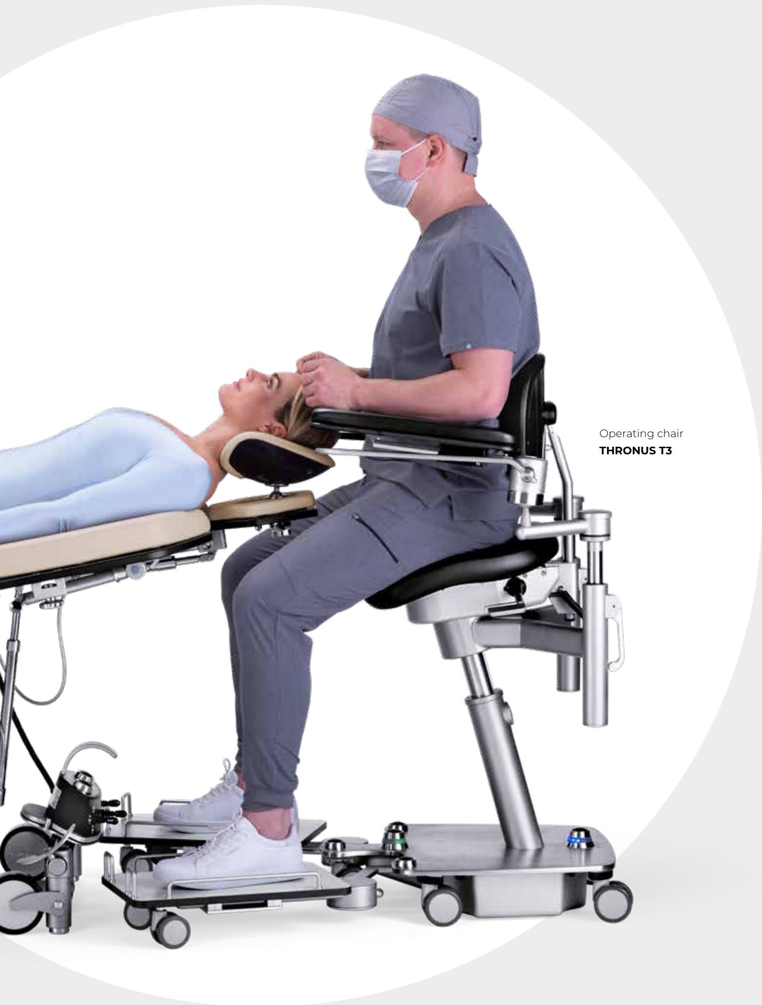
Operating chair THRONUS T3