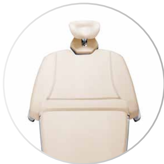
Integrated armrests for easy arm positioning