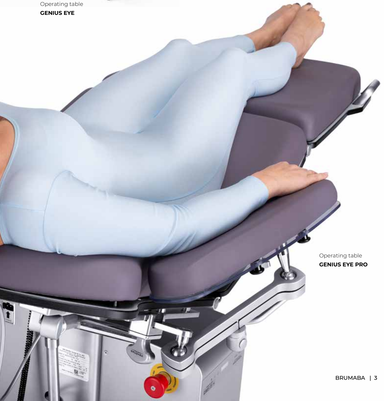
Operating table GENIUS EYE PRO