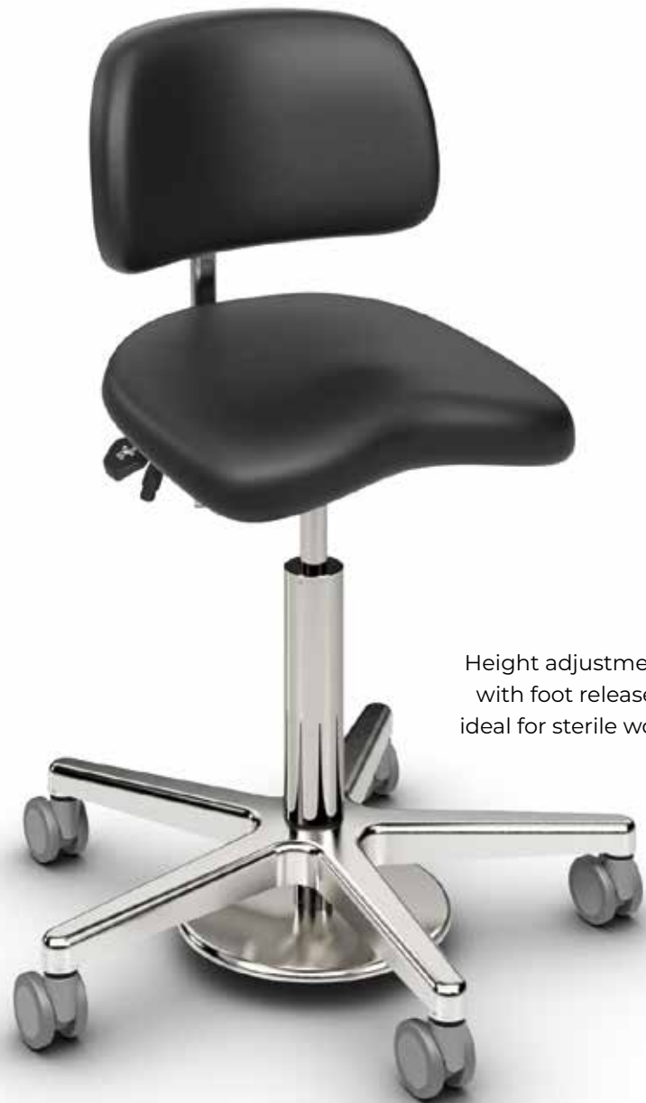
Height adjustment with foot release, ideal for sterile work