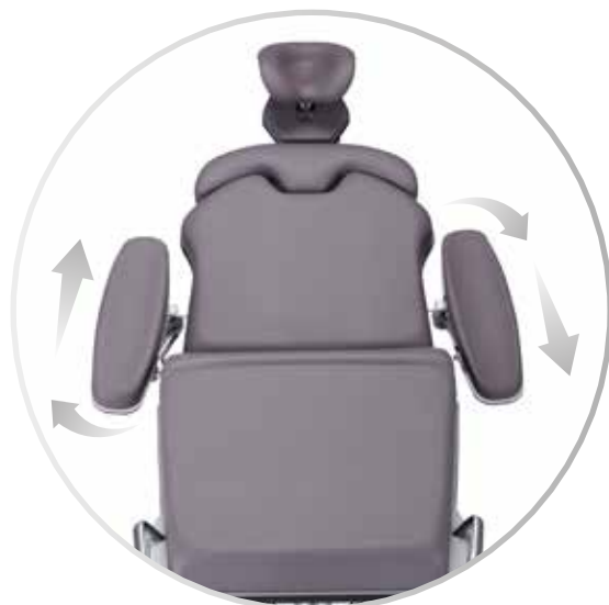
Flexible armrest adjustment