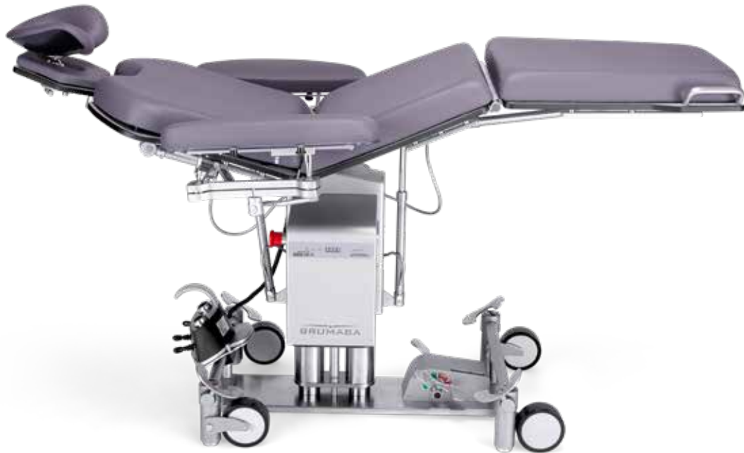
GENIUS EYE PRO