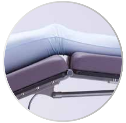
Extra-thick padding for maximum patient comfort