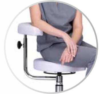
Simple height adjustment of the backrest