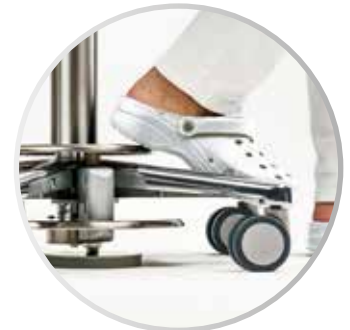
Optionally with brake