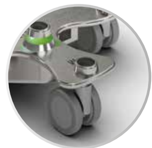
Memory function enables programming of two seat heights