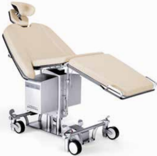
Operating table GENIUS EYE