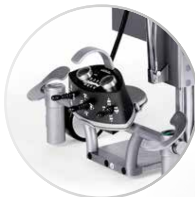
Optional foot control: The surgeon can carry out intraoperative adjustment without compromising sterility.