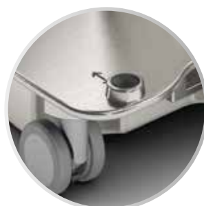
Electromechanical height adjustment