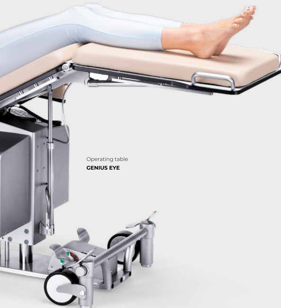
Operating table GENIUS EYE