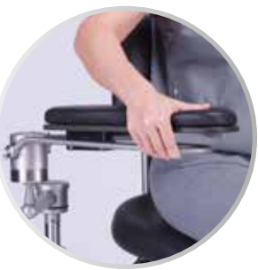
Intraoperative armrest adjustment