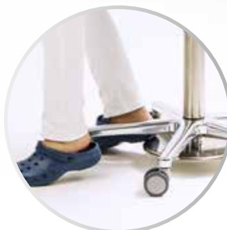
Height adjustment with foot release, ideal for sterile work