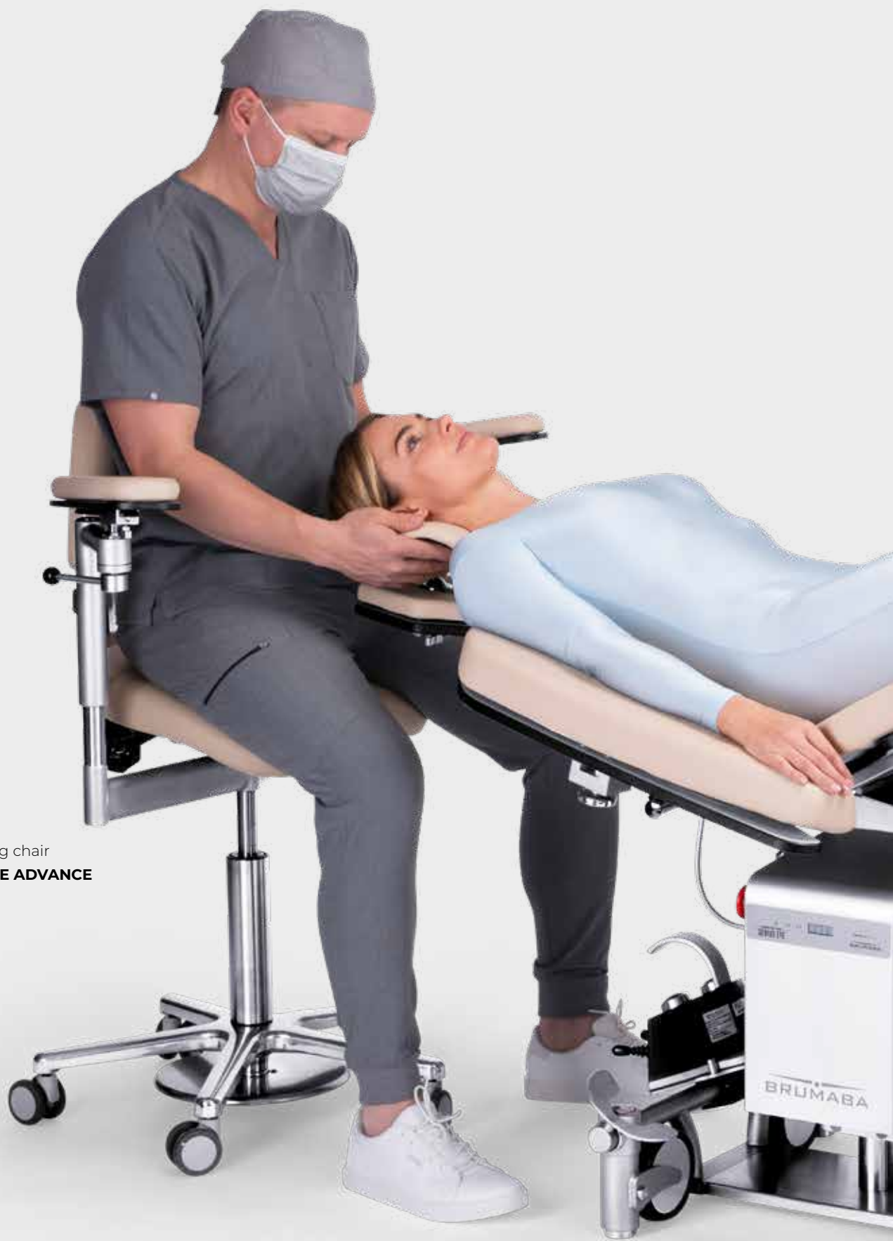
Operating chair BALANCE ADVANCE