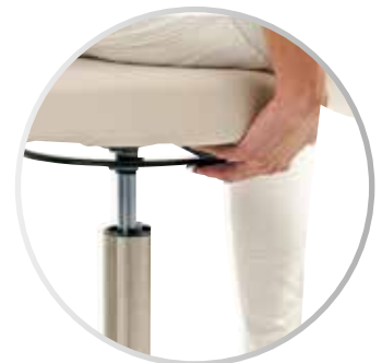
Height adjustment with hand release