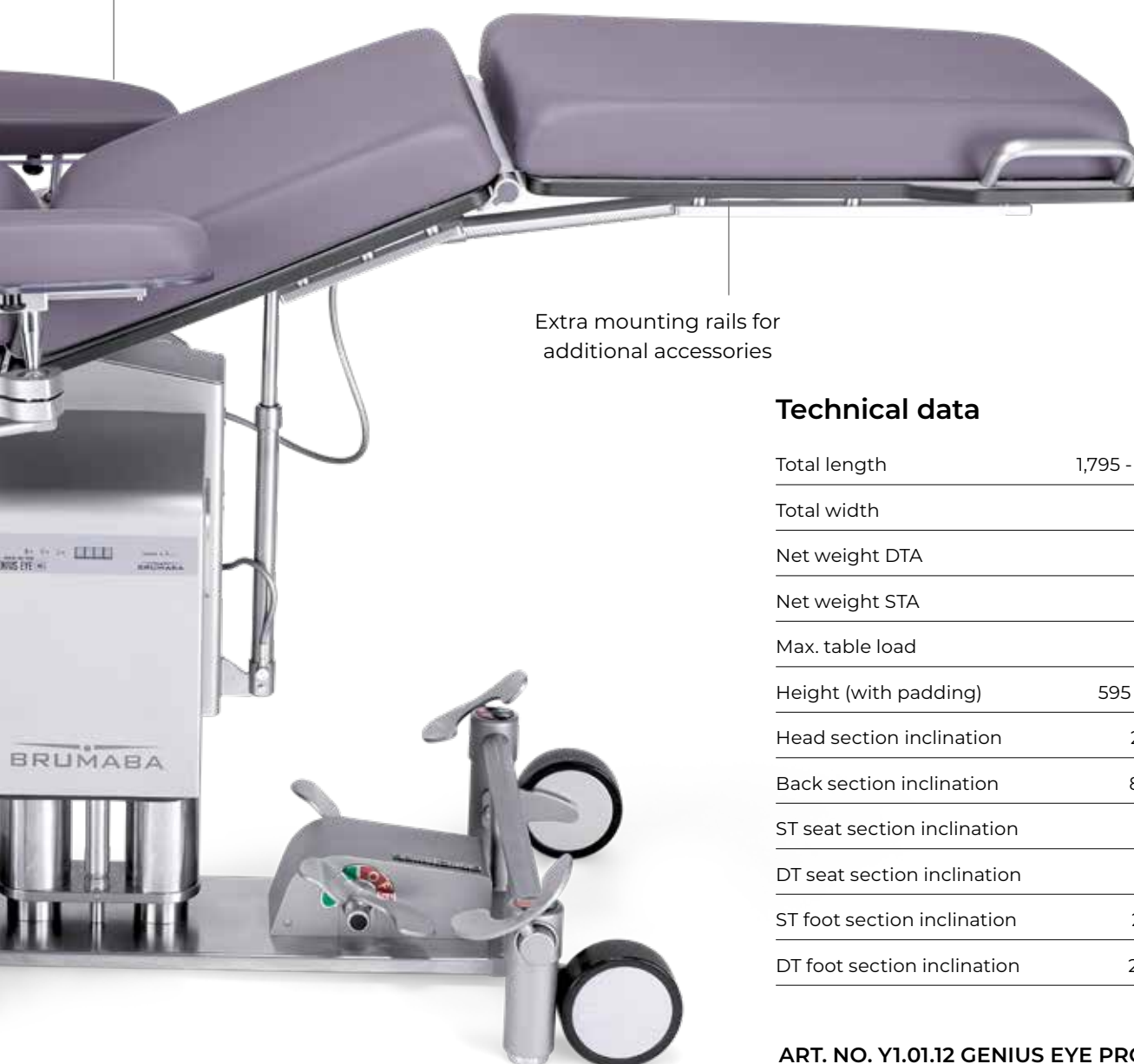
Extra mounting rails for additional accessories