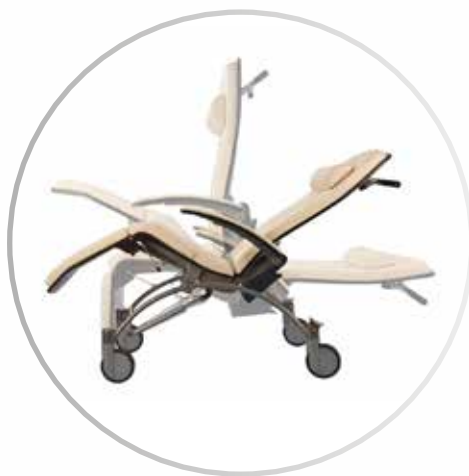
Lying surface infinitely adjustable