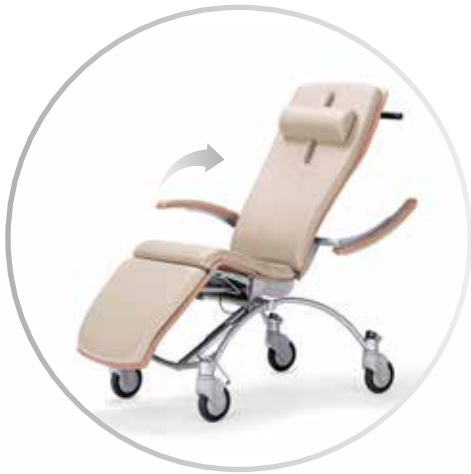
Armrests automatically adjusted to reclining position (foldable)